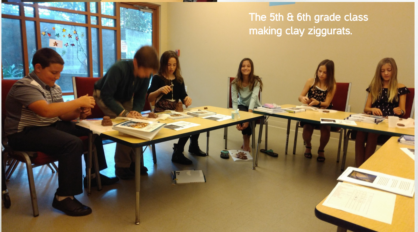
The 5th & 6th grade class making clay ziggurats.