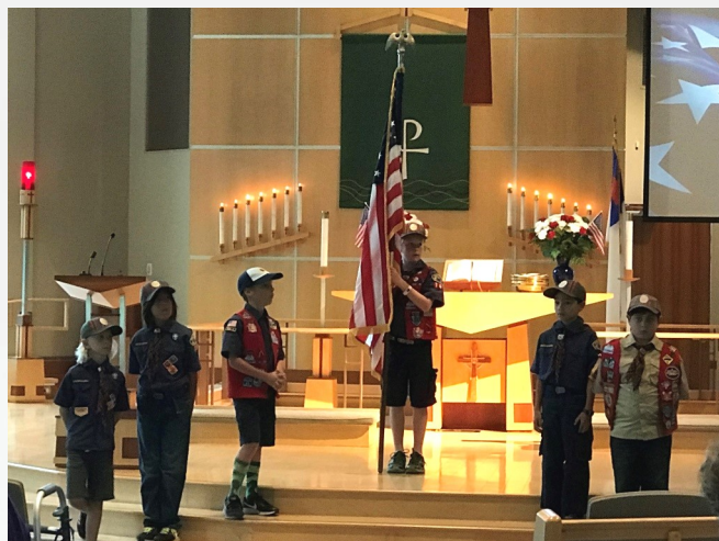
Thank you to the Carlsbad Cub Pack 740 for presenting the flag at our 8:30am service!