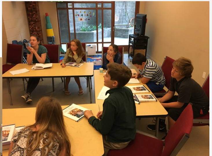
The 5th & 6th grade Sunday School class—join us at 9:45am on Sundays!