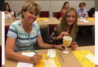
The completed chalices ready to be fired.