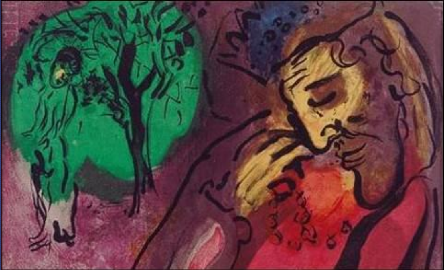
David & Absalom, 2 Samuel 13-18