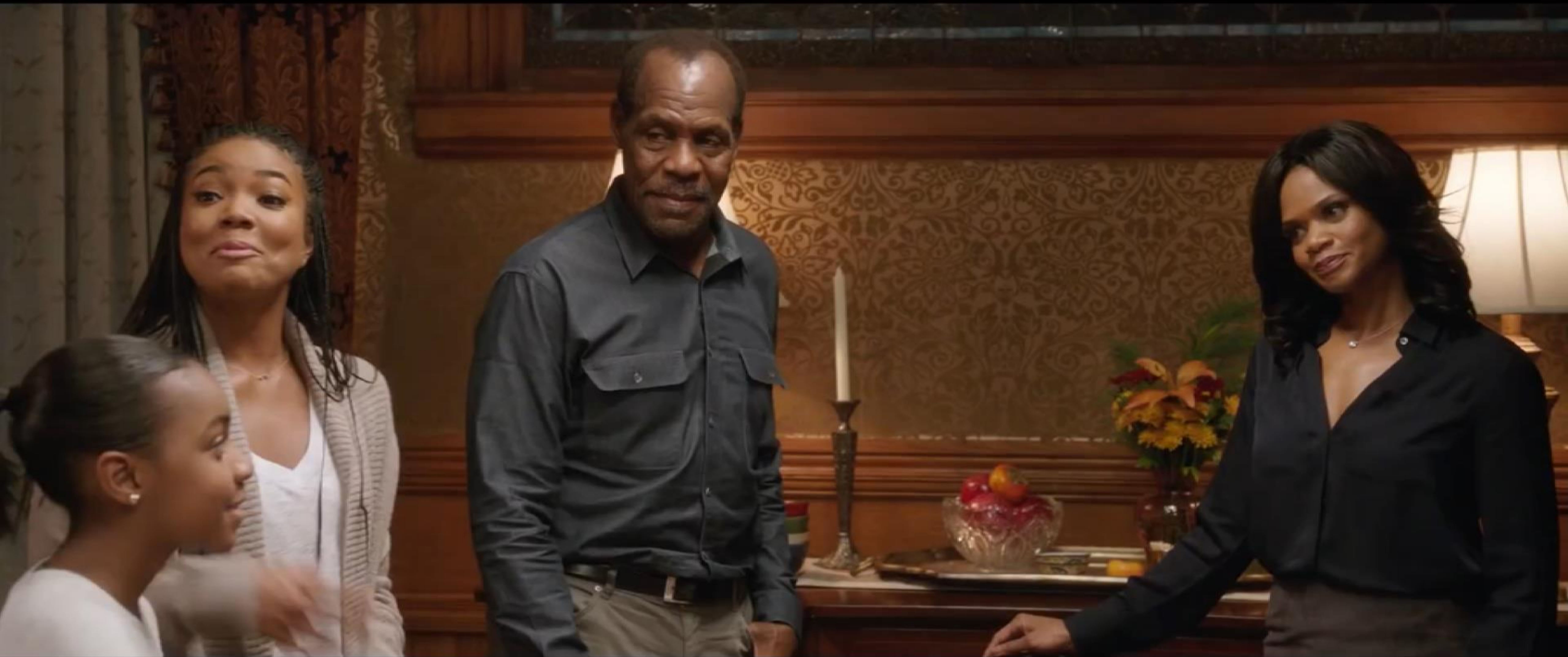
A clip from the movie "Almost Christmas" (2016)