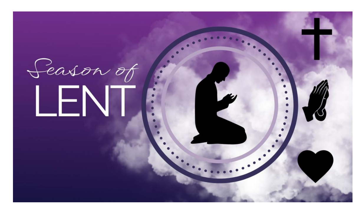
March 30, 2025 ~ 8:30am